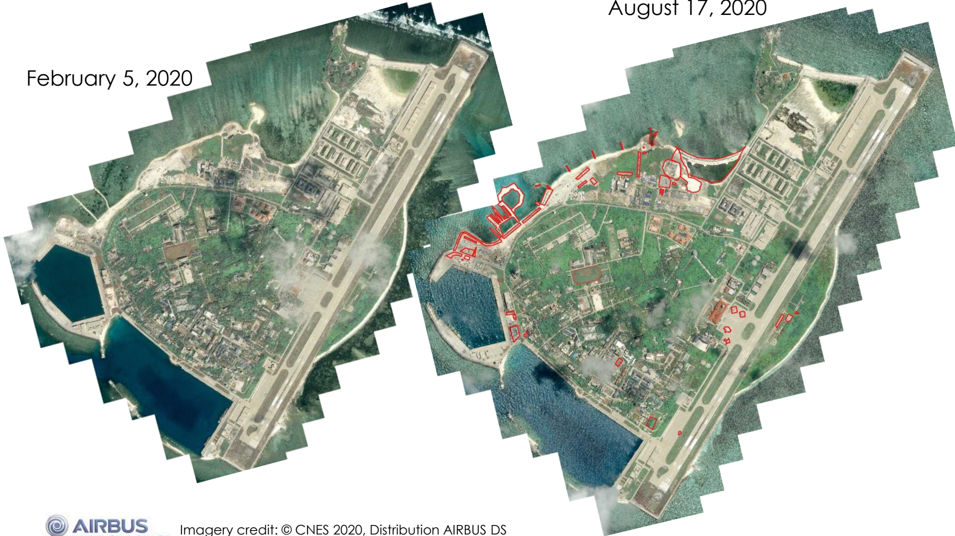
August 17, 2020