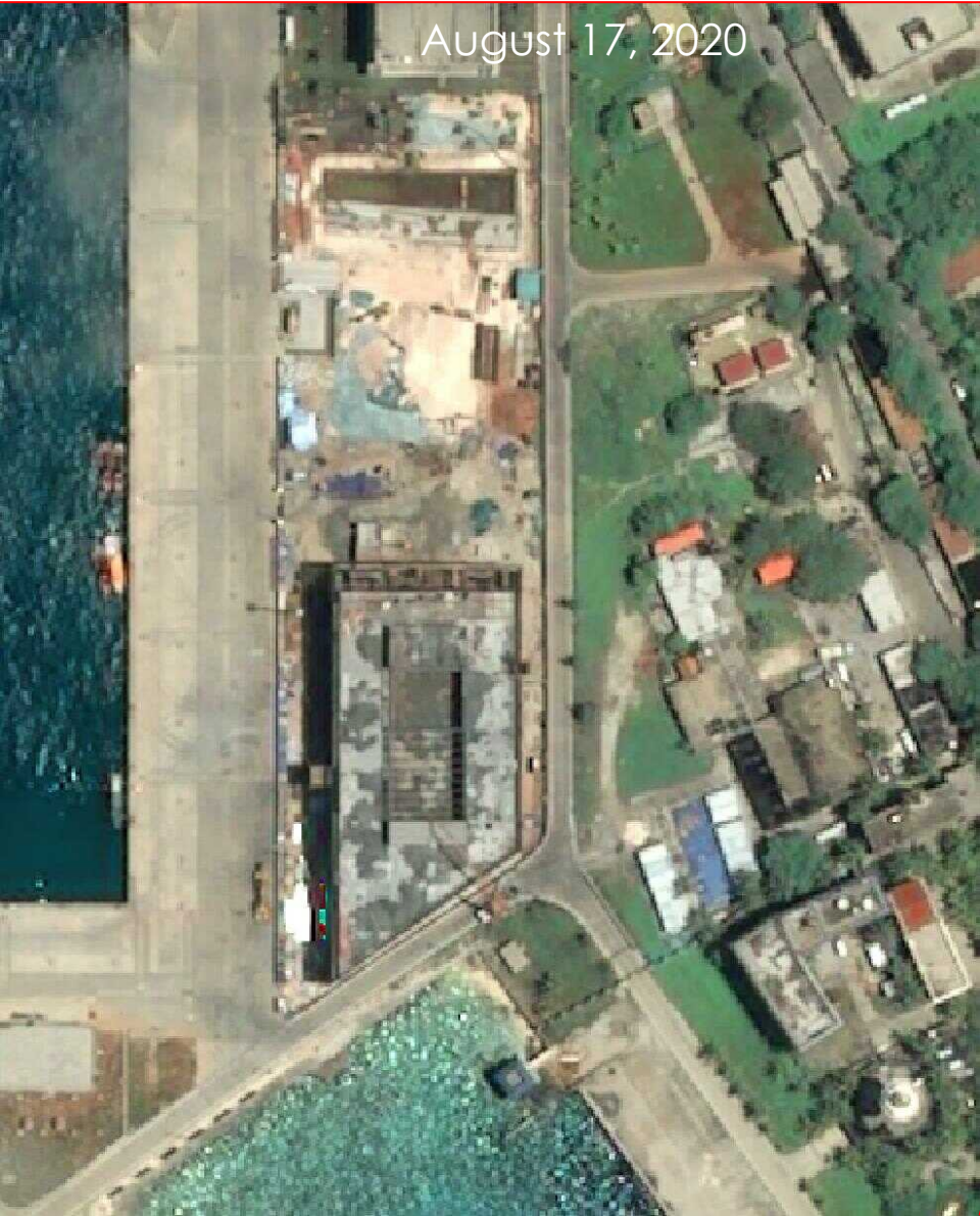
August 17, 2020