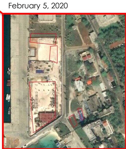
February 5, 2020

400% increase in planes on the island since February.