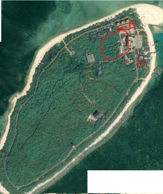
February 16, 2020