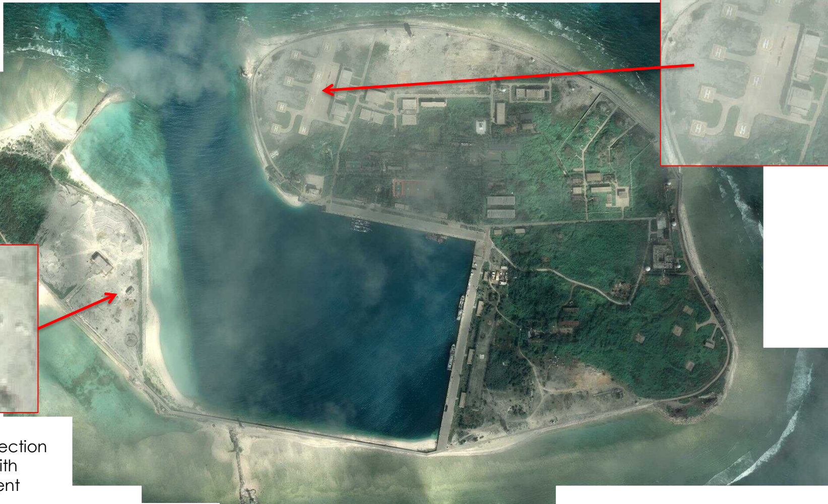
A new small structure in a section of the island with radar equipment