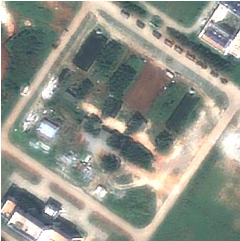
December 15, 2021

Two green rectangular structures removed, brown central structure with red stripe constructed, path from road to central structure added, addition of significant amount of sand. The sand, trucks and/or storage containers (along inner strip of sand) may indicate construction is still in progress.