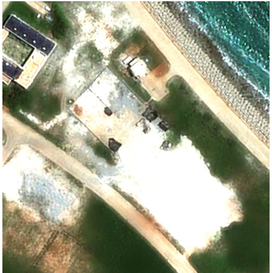
May 5, 2022