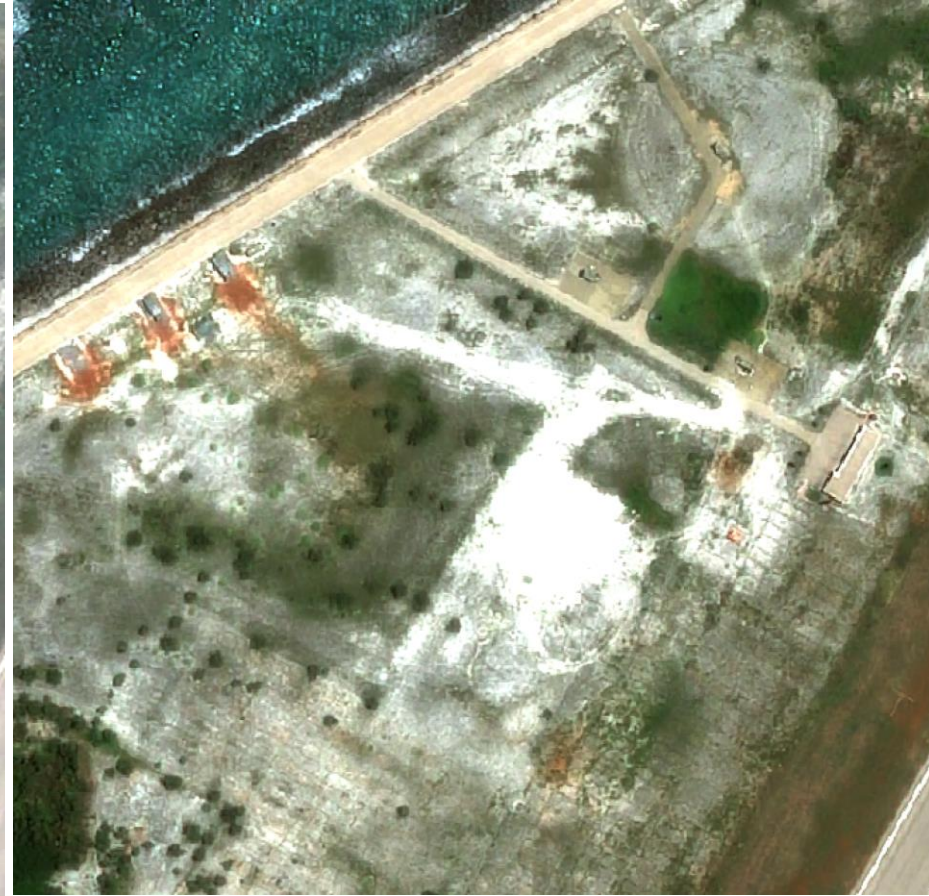
May 5, 2022