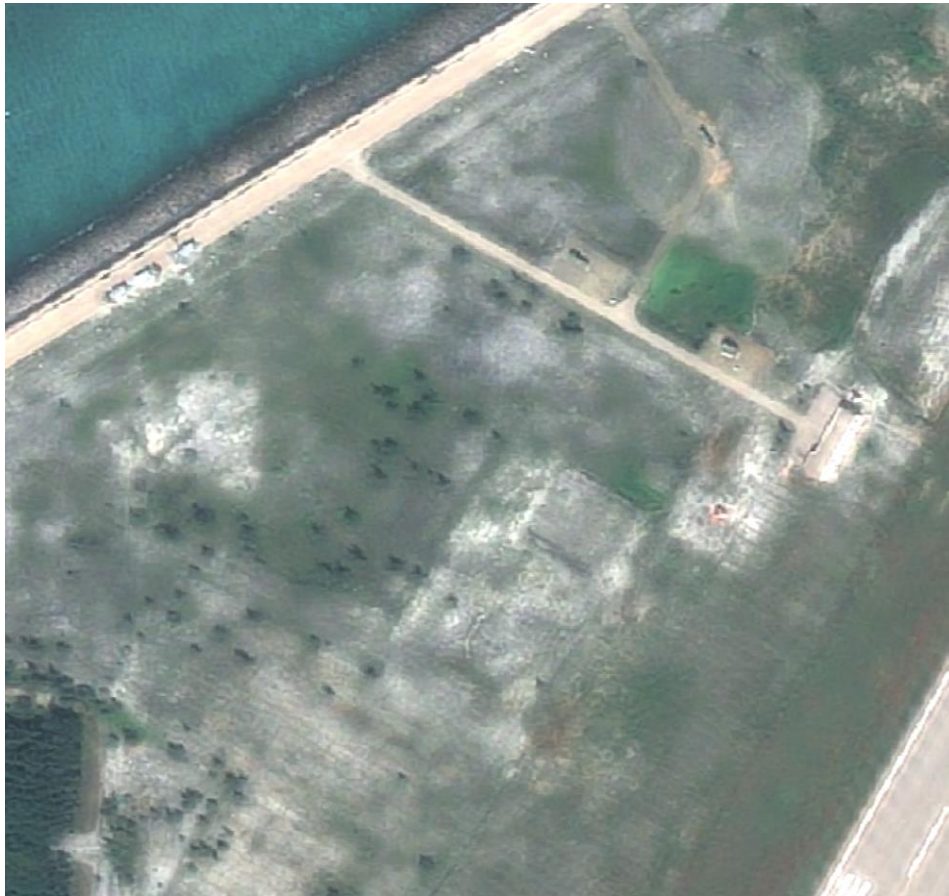
December 15, 2021

Presence of structures and materials (rust-colored stockpiles), addition of significant amount of sand. Paths created to road and to location of material stockpiles are likely to facilitate use of heavy equipment. Emerging white squarish shape indicates possible foundation.