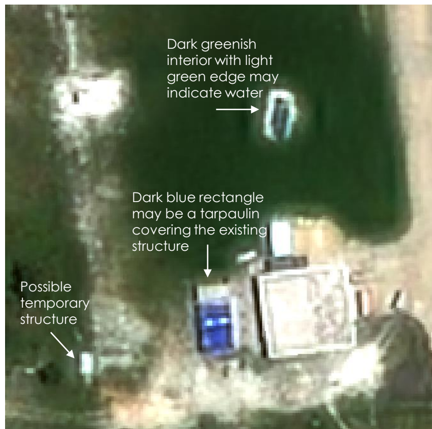
May 5, 2022