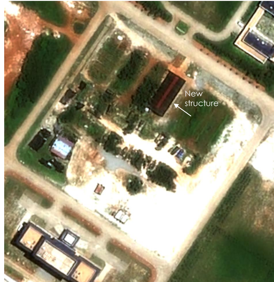
May 5, 2022