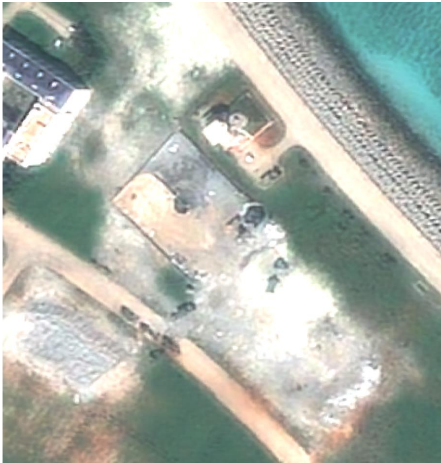
December 15, 2021

Presence of probable construction equipment (black colored), trucks (rectangles on road in first image), and materials (lumpy gray, rust colored, and white), addition of significant amount of sand. Emerging white rectangular shape indicates probable foundation.