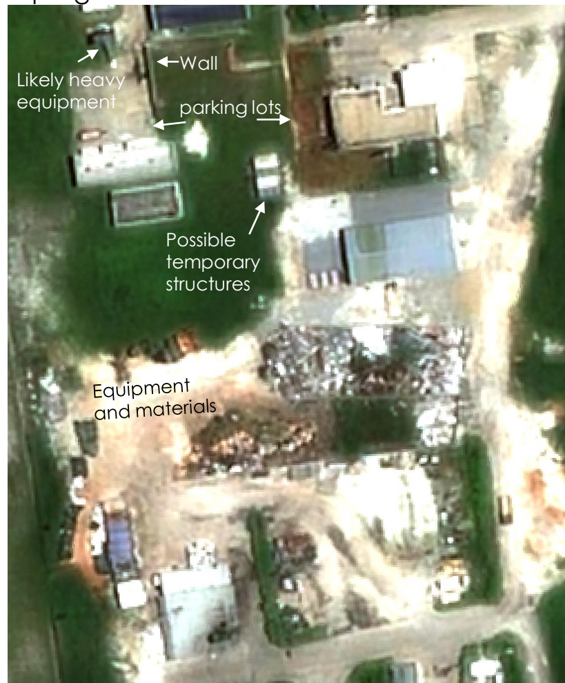
May 5, 2022