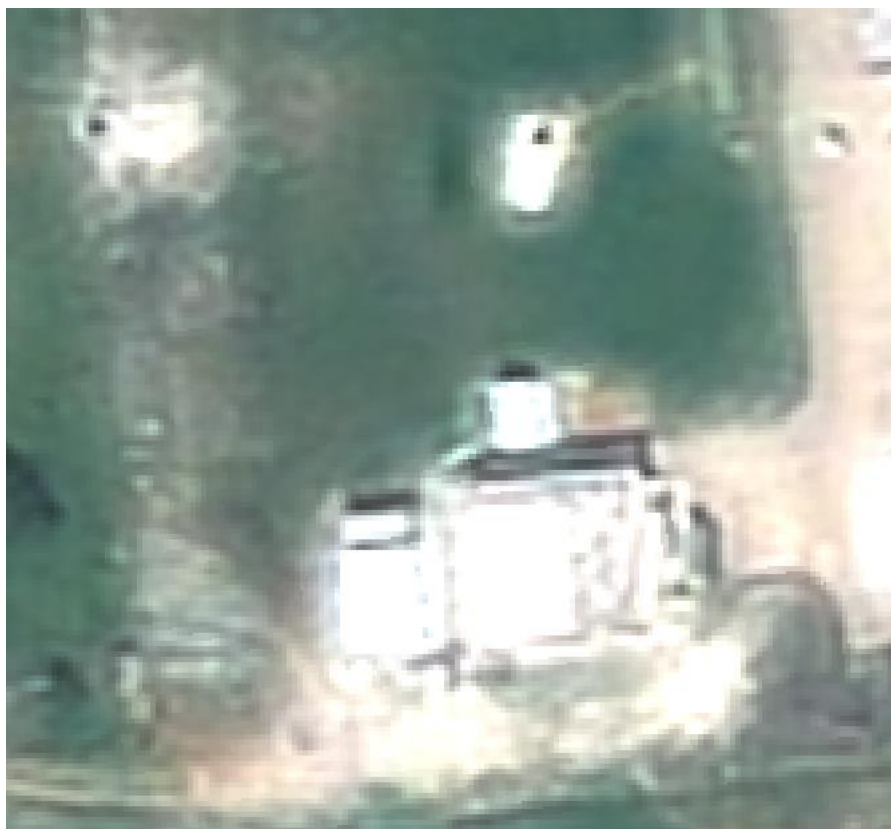
December 15, 2021

Changes to existing site may indicate maintenance, expansion, or addition of new features.