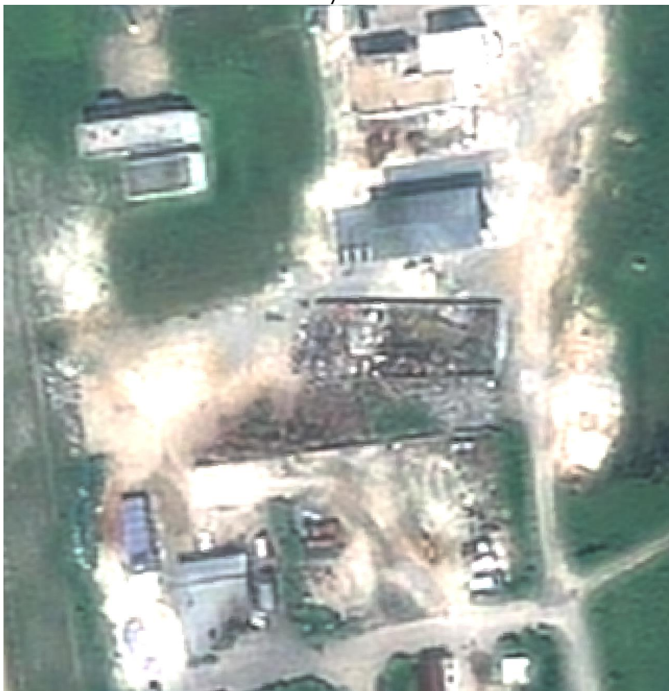
December 15, 2021

New wall and parking lots, and new possible temporary structures. Presence of equipment and additional materials may indicate construction is still in progress.