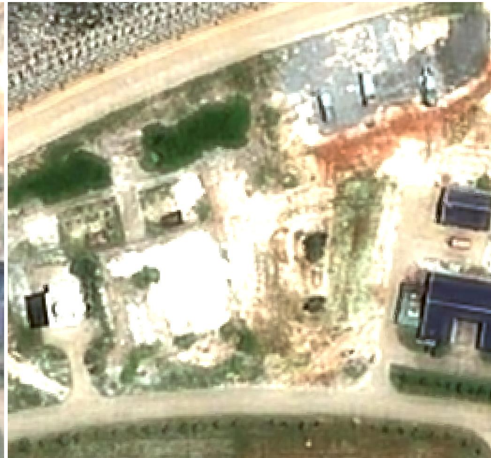
May 5, 2022