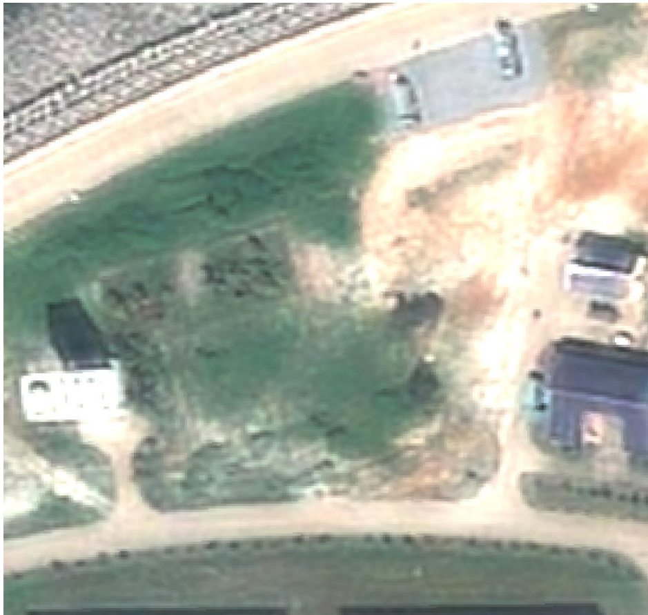
December 15, 2021

Land clearing, apparent paths to road and materials stockpiles in progress, addition of sand, appearance of materials (rust colored, white, and gray) and equipment (rectangles near road are likely trucks that brought materials). Emerging white square shape may be a foundation.